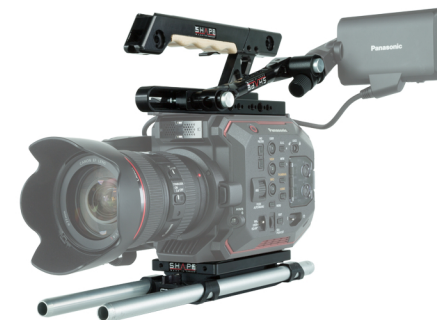
FINAL RESULT / RÉSULTAT FINAL

SHAPE RESERVES THE RIGHT TO USE ANY PHOTOS INCLUDING SHAPE PRODUCTS FOR MARKETING PURPOSES