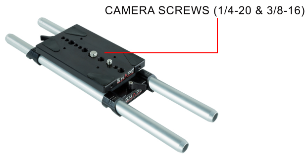
SKU | EVAB15 (X1)