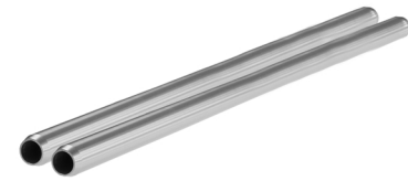
SKU | 15TUBE12 (1 PAIR)