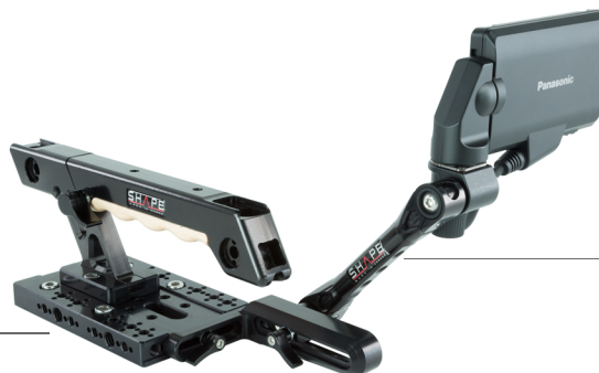
VIEW FINDER BRACKET ARM

SOLID ANODISED ALUMINUM LIGHTWEIGHT DESIGN DESIGN LÉGER D'ALUMINIUM ANODISÉ