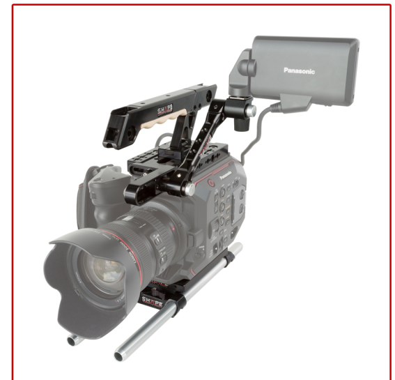
SKU | EVALWBT