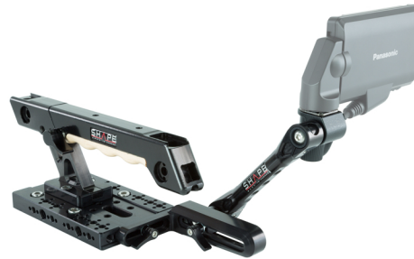
SKU | EVAHV1 (X1)