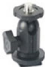
D. Mini Ball Head