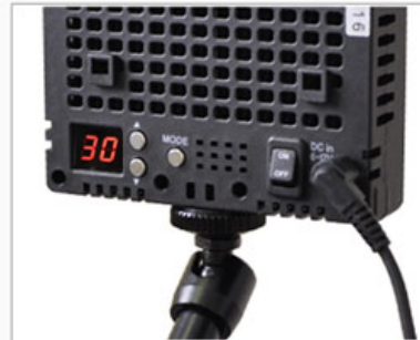
Connecting External Power