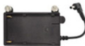
C. Battery mount