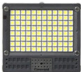
A. Main Body