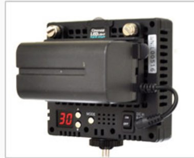
With NPF Type Battery