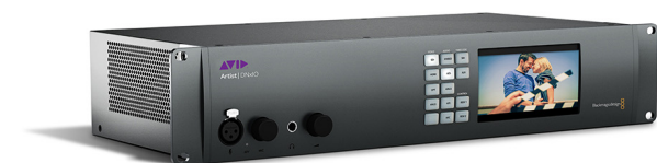
Capture, monitor, and accelerate SD, HD, UHD, 2K, and 4K editing with an Artist | DNxIO interface.

For the latest Media Composer requirements, qualified systems, and configuration guidelines, please visit www.avid.com/MCreqs .